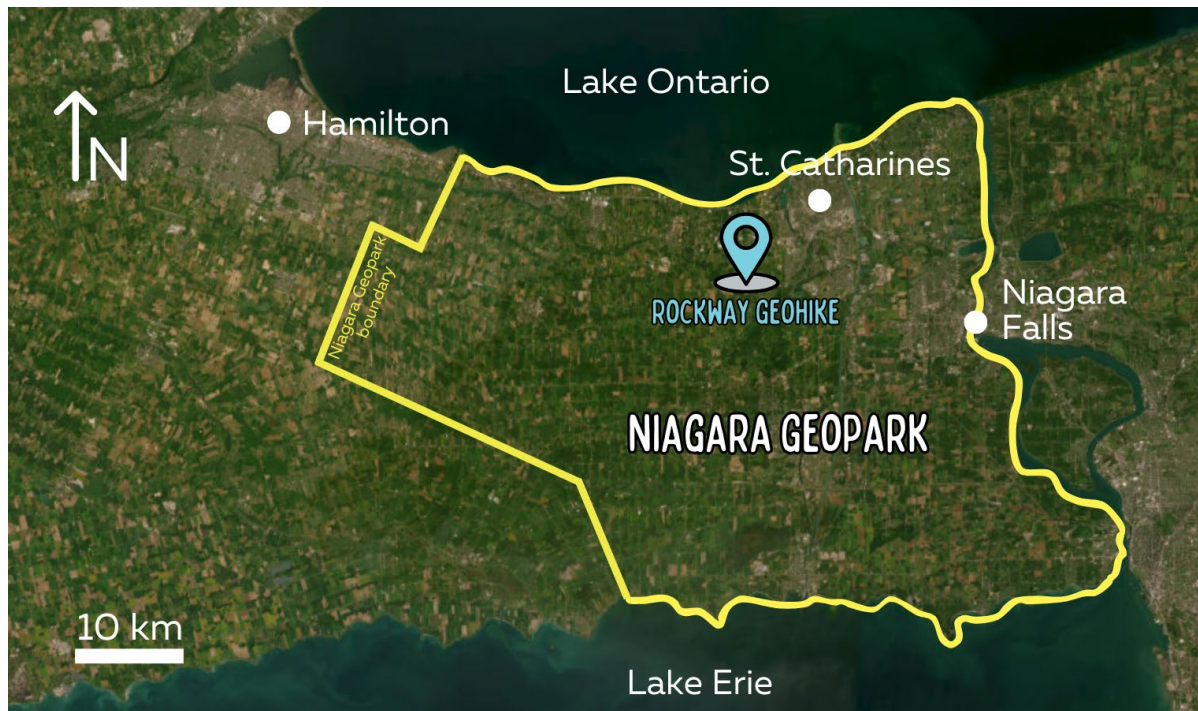
Figure 1. Map of the Niagara Peninsula, showing location of the Rockway GeoHike (blue marker).

December 18, 2024, Toronto, Ontario: The APGO Education Foundation (“APGOEF”) and the School of Environmental and Earth Sciences at McMaster University are pleased to announce the release of the Rockway GeoHike , located on the north side of the Niagara peninsula, in the Niagara Geopark and the Rockway Conservation Area (see Figure 1). This virtual tour, which follows the Bruce Trail, features 6 stops that highlight the local geology. To see this as well as all our GeoHikes, visit our GeoHikes page .