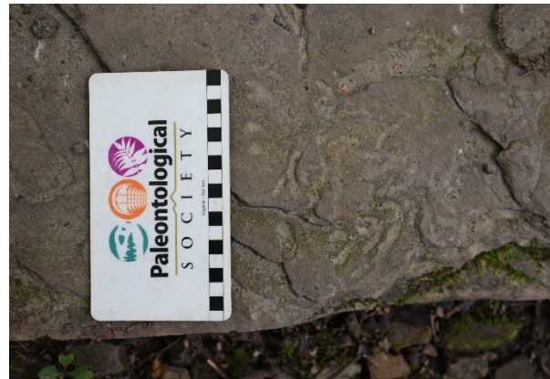
Figure 3. Chondrites trace fossil preserved in limestone on the Rockway GeoHike.