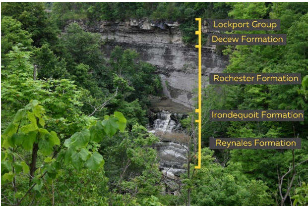
Figure 2. Exposed rock units at Rockway Falls – Stop #1 on the Rockway GeoHike.