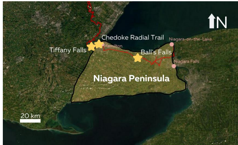
Map of Niagara region showing Geotrail locations.

Want to know more about the fascinating geological and environmental history of the Niagara Escarpment? – Watch our Geovideo at https://geoscienceinfo.com/geovideos .