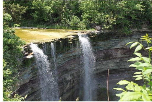
Lower Falls, Ball's Falls Geotrail.

Ball's Falls Geotrail – The Ball's Falls Geotrail takes you on a tour from the Upper Falls to the spectacular Lower Falls. Here, you will learn about how these waterfalls formed by fluvial erosion after glacial ice that covered the Niagara area between 22,000 and 13,000 years ago retreated to the north. As you walk the approximately 1-kilometre trail, see fossils, dolostone outcrops, and a massive rock fall near the trail.