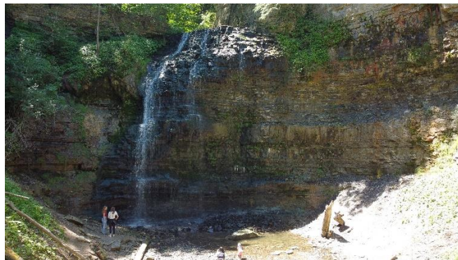
Tiffany Falls, Tiffany Falls Geotrail.

Tiffany Falls Geotrail – This area is considered an Earth Science Area of Regional Significance and does not lack beautiful views and interesting geology! Here, you can see active slope and valley processes. The interactions between the river and land formations have created unique habitats where different creatures are able to thrive. Follow this exciting Geotrail to explore the links between local wildlife and geology associated with the Niagara Escarpment bordering the Dundas Valley.