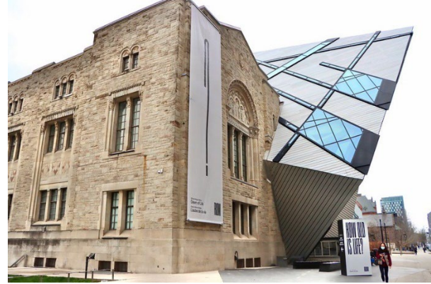
Figure 3. The Royal Ontario Museum (Bloor Street entrance) showing its spectacular crystal façade.