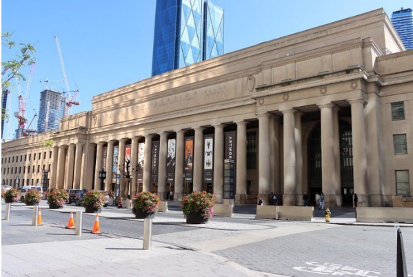
Figure 2. The front exterior of Union Station, made of limestone.